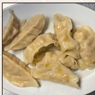
Dumplings (8) $5.95 Deep fried or Steamed