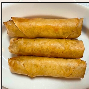
* Egg Rolls (3) $5.95 Deep fried Vietnamese egg rolls